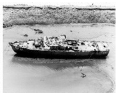
HMAS Arrow, lost in Darwin during Cyclone Tracy, 1974

A local businessman purchased what was once a proud patrol boat, his idea was to restore her, but it proved far too expensive, therefore a decision was made to break her up where she lay.