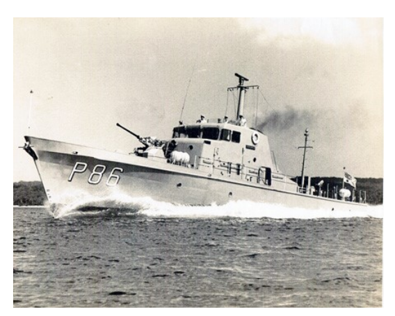
HMAS Archer in Jervis bay showing her original thin style pennant number

Five Patrol Boats were purpose built for New Guinea service and named accordingly. They were used for patrol and general duties in Australian and surrounding waters before transfer to the PNG Defence Force. The boats destined for New Guinea service were HMAS Aitape, Samarai , Ladua , Lae and Madang . These