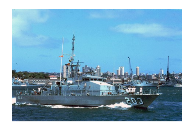
HMAS Fremantle RAN image

The acquisition of replacement patrol craft was announced in April 1975 with eleven shipbuilders invited to tender. On 22 September 1977 the Minister of Defence (James Killen) announced the PCF450 design had been selected and fifteen boats would be built at a cost of AUD 115 million.