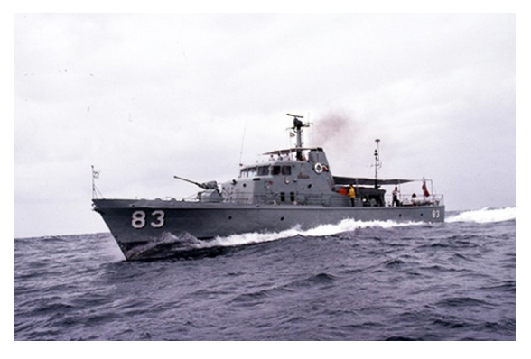
HMAS Advance at sea.

HMAS Advance is the last remaining Attack class patrol boat maintained as an operating exhibit by the Australian National Maritime Museum in Darling Harbour, Sydney. Advance is a proud reminder of the twenty boats built between 6 July 1967 and 6 November 1968 to protect Australia's 200nm economic zone, fishing rights and just about any other task directed. They welcomed fleeing South Vietnamese after the Fall of Saigon in April 1975, and towed many a craft safely to our shores. They were workhorses with more sea time than many major fleet units. Once a "boat-man", you always wished to stay in what was often referred to as "McHale's Navy". There wasn't much of our extensive coastline that we didn't pass or "drop the pick" in some secluded bay or river entrance, from Cooktown into the Gulf and down the West Australian coast.