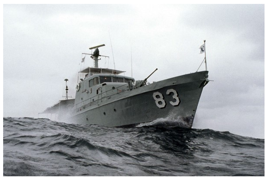
HMAS ADVANCE launched 16th August 1967, commissioned 6 February 1968.

This paper examines the design, construction and operations of the Attack class and provides some insight into their habitability.