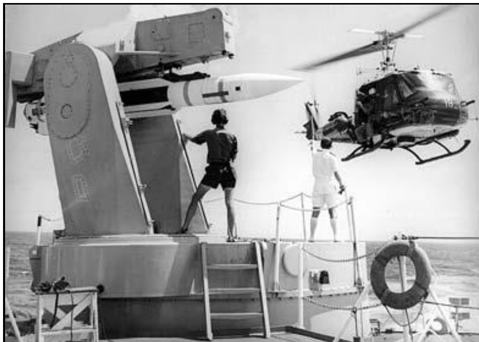
HMAS Hobart receiving mail in Vietnam 1967

If you have a photo to share please send it to callthehands@navyhistory.org.au