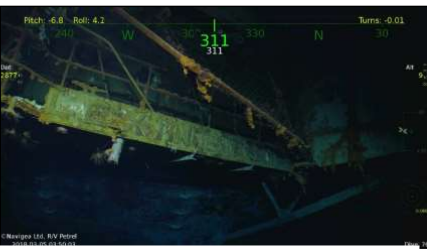
Wreck of USS Lexington, ships name board.

Unfortunately, little of that interest centred on the strategic implications that lead up to the battle and even less on the consequences, particularly for Australia. It is regrettable that many Australians are unaware of the strategic importance of this maritime contest and are fixated on one of the consequences flowing from the result, namely the actions on the Kokoda Track.