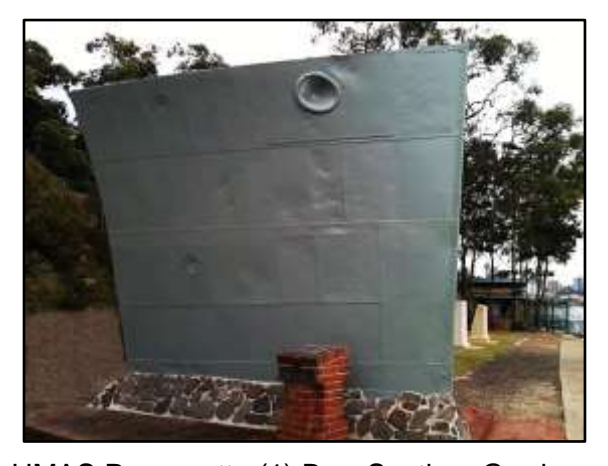
HMAS Parramatta (1) Bow Section, Garden Island Sydney.