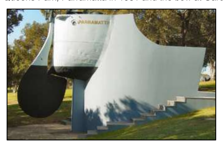
HMAS Parramatta (1) stern section.

In 1972, the Naval Historical Society of Australia began a project to recover the bow and stern for a memorial to the vessel and its later namesakes (Parramatta (2) and Parramatta (3), and Australian naval history generally. However, funding and other constraints delayed the project with the stern finally being mounted in Queens Park, Parramatta in 1981 and the bow at Garden Island in 1986.