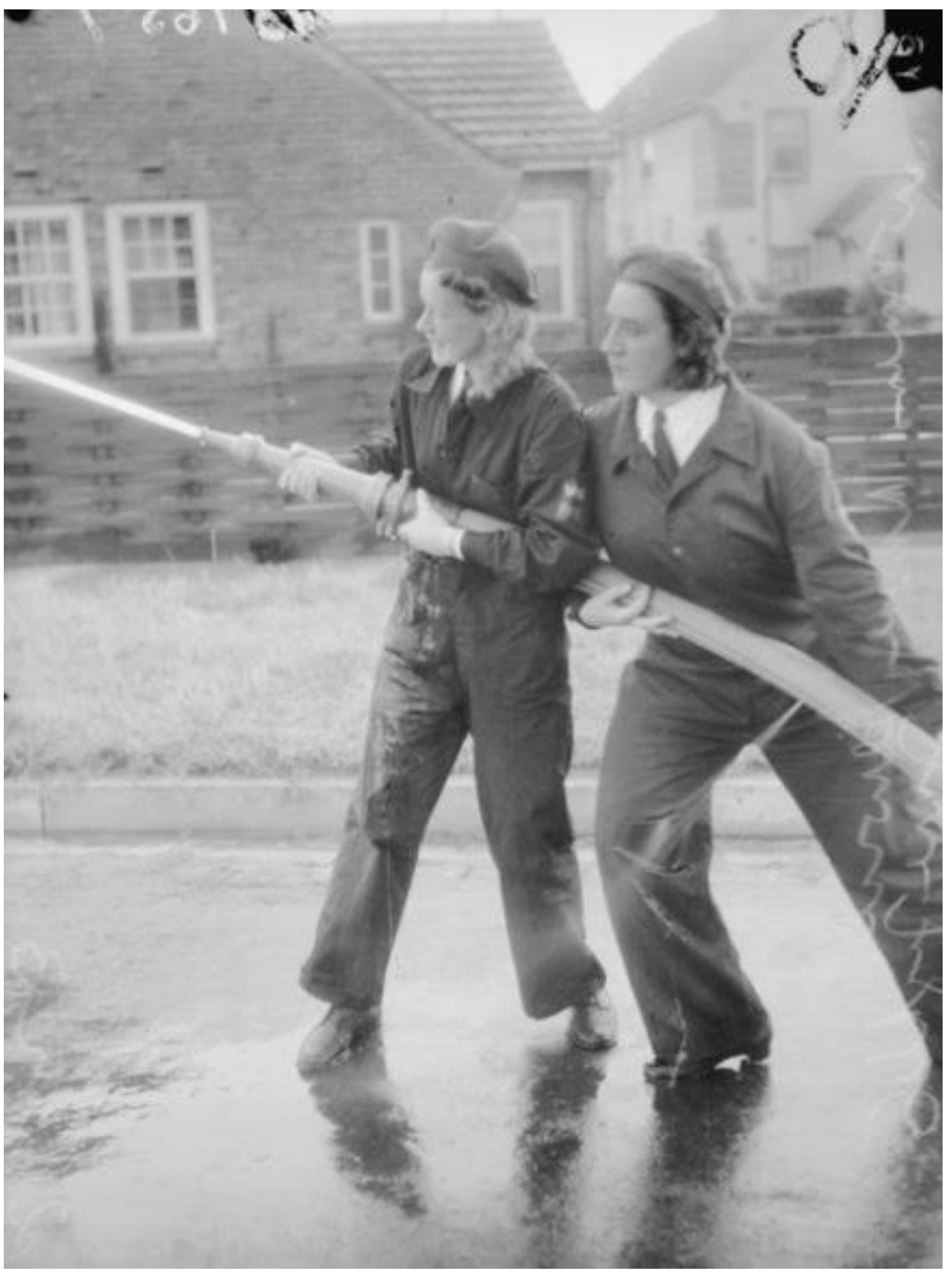
Two members of the Women's Royal Australian Naval Service (WRANS) Fire squad carry out a drill in Melbourne, January 1943