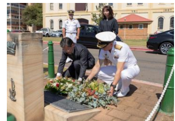
Exploring Australian Naval History