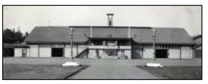
Drill Hall 1939

"What is wrong with Flinders as a site for a naval college? The fact of the matter is there is nothing right with it.....whoever bought the site.....must have done so when the tide was in, because one can scarcely see the sea from the shore when the tide is out. It is altogether unsuitable as a site for a naval college."