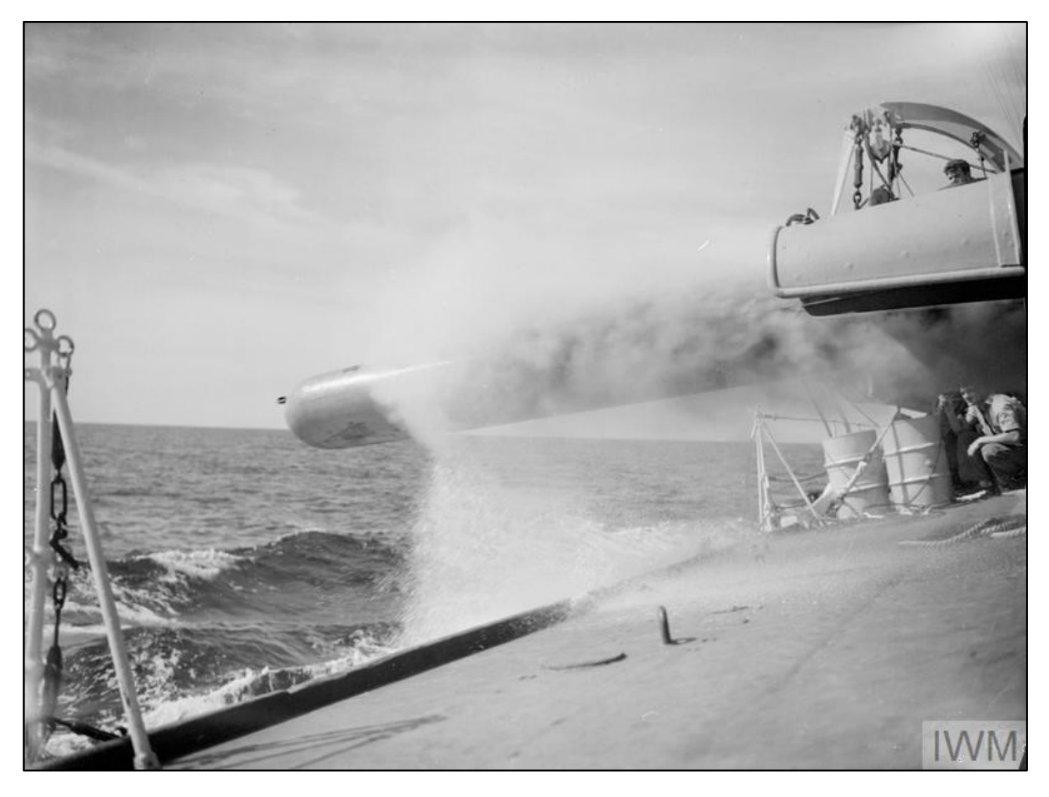
A practice torpedo leaving the tube in HMAS Warramunga enters the water at high during Commonwealth Fleet Exercises in June 1952 off the west coast of Korea.