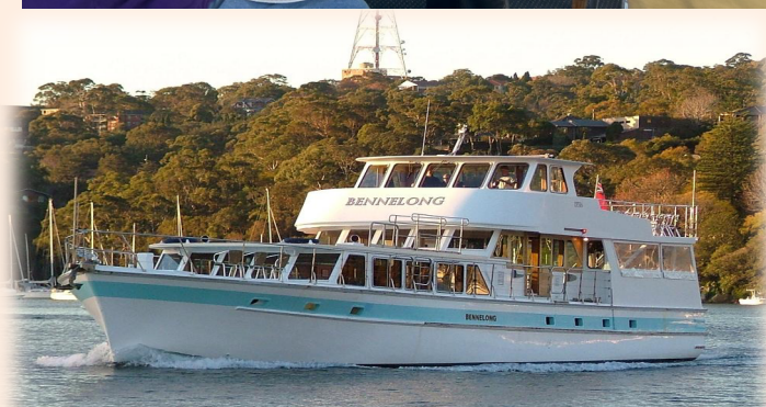
MV BENNELONG - Caprice Charter