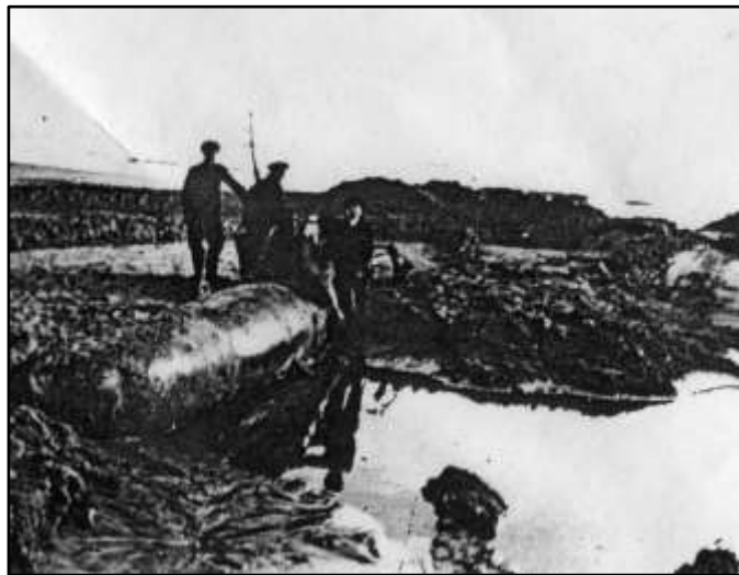
Live torpedo exposed

Loading the submarine into the LCTs proved more difficult than anticipated, as the structure of the ramps and the many projections on the side of the submarine seemed created for the sole purpose of fouling each other, but with the projections unwelded and with the D8 pulling from inside the LCTs and the bulldozer pushing, both sections of the submarine were hauled aboard.