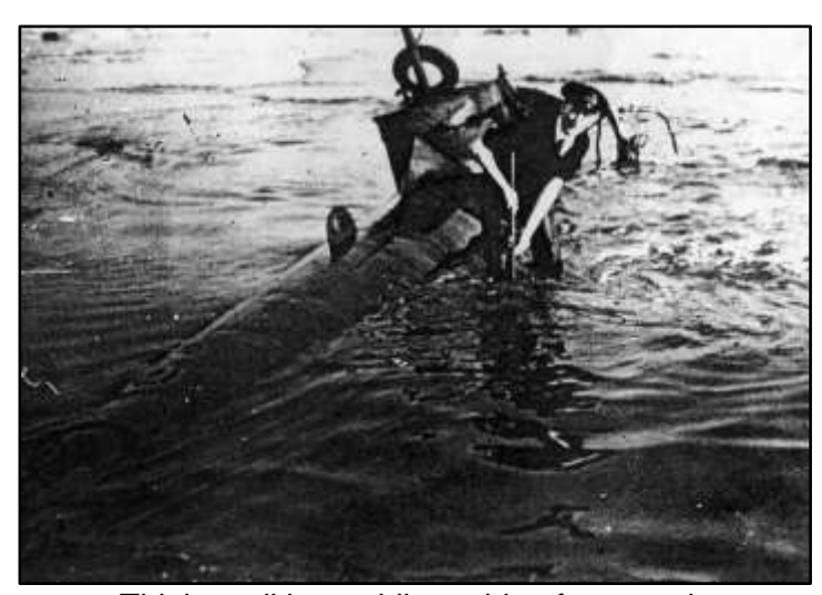
Tidal conditions while probing for torpedo

A preliminary examination showed that the submarine was approximately 40 feet in length by 5 feet in diameter and built of about ¼ inch plate, and for that reason alone quite different to the much smaller Bieber class he had recovered at Dover in January. The prisoners had fired the scuttling charge and blown out a whole section of 4-6 feet abaft the conning tower; otherwise the submarine was relatively intact. The submarine was about 60 percent submerged in the sandbank, bows buried but on an even keel. Probing on the port side suggested a torpedo, but nothing was felt on the starboard side.