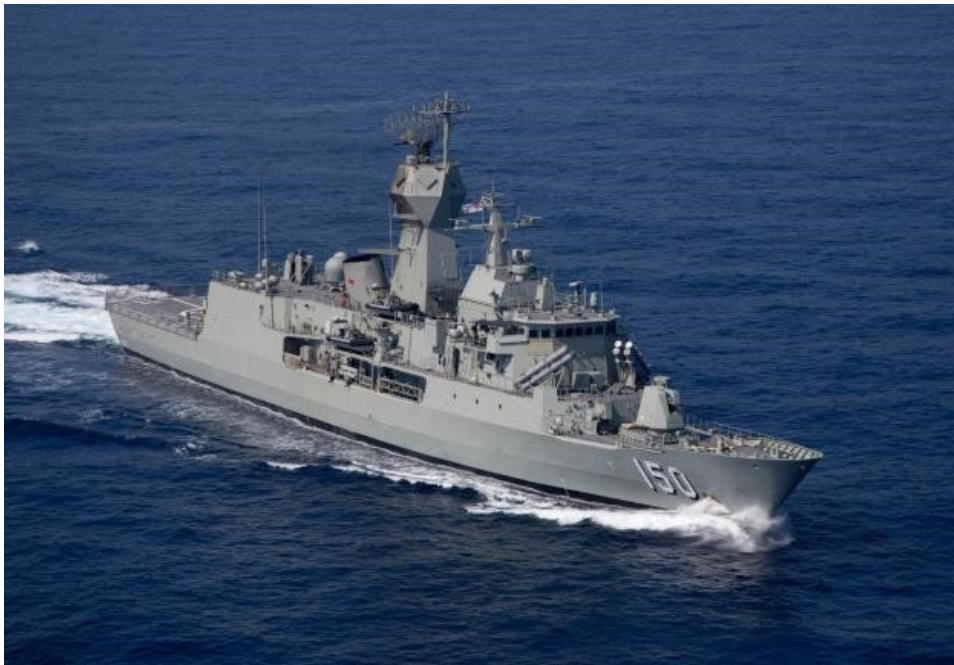
HMAS ANZAC III