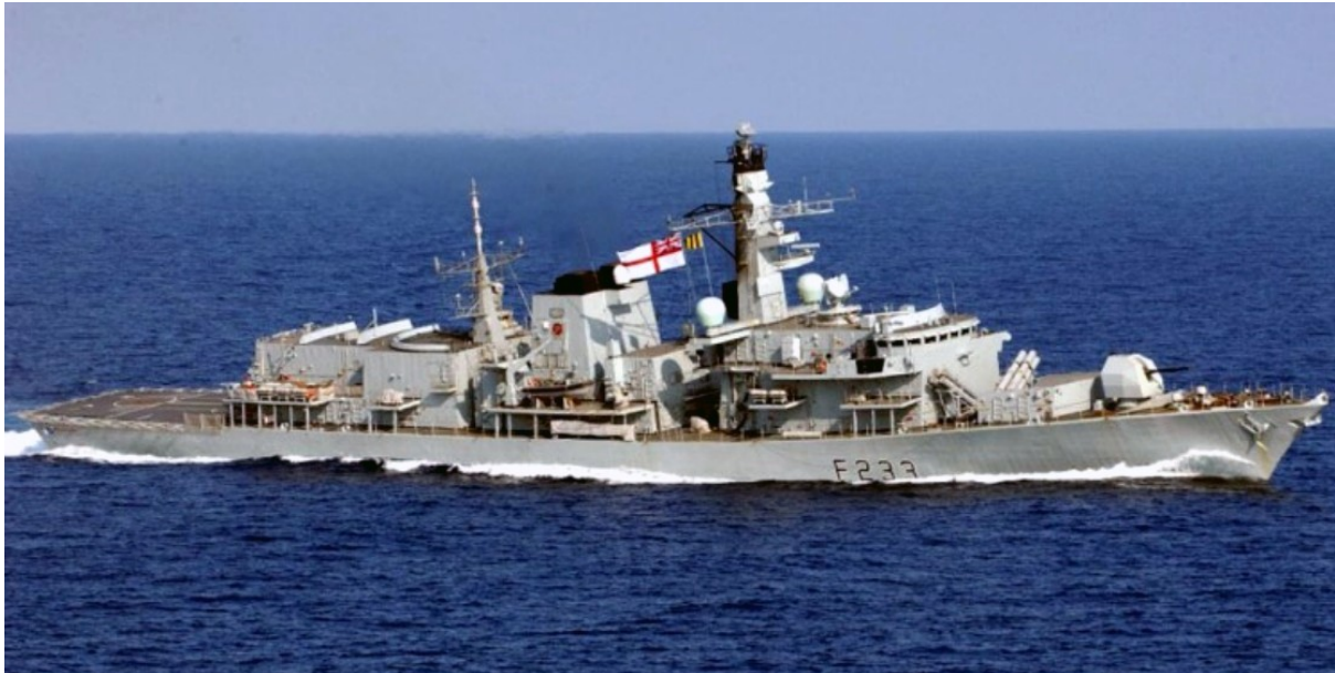
HMS Marlborough, Duke class, Type 23 Guided Missile Frigate

The Royal Marines were faced by resistance from the Iraq Forces and called for immediate NGS to engage Iraq Command Posts. ANZAC received the first call-for-fire at 05:58. ANZAC fired six ranging salvos followed by a five-round fire-for-effect with the salvos hitting bunkers and artillery positions. ANZAC answered another call-for-fire destroying a T59 artillery piece in a fire mission of just three rounds. It was extremely accurate fire and at near maximum range.