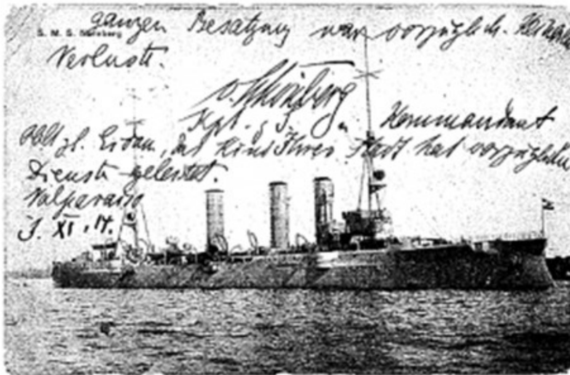
Post card of SMS Nurnberg eds "KAIS - DEUTSCHE / MARINE- / SCHIFFSPOST / 5 / 3 Nov. / 14"

Following the decisive Battle of Coronel where the German squadron defeated a Royal Naval squadron commanded by Rear Admiral Sir Christopher Cradock, the victors called at Valparaiso primarily to coal ship. From here a post card was sent from the Captain of SMS Nurnberg to the Mayor of Nurnberg dated 3 November 1914. Translated, this reads: 'A quick note to say the SMS Nurnberg sank the English heavy cruiser Monmouth on the night of 1st November off the coast of Coronel (Conception Bay, Chile). The weather was stormy. The conditions of the whole engagement was excellent.' This card most likely went in diplomatic mail via the German Consulate.