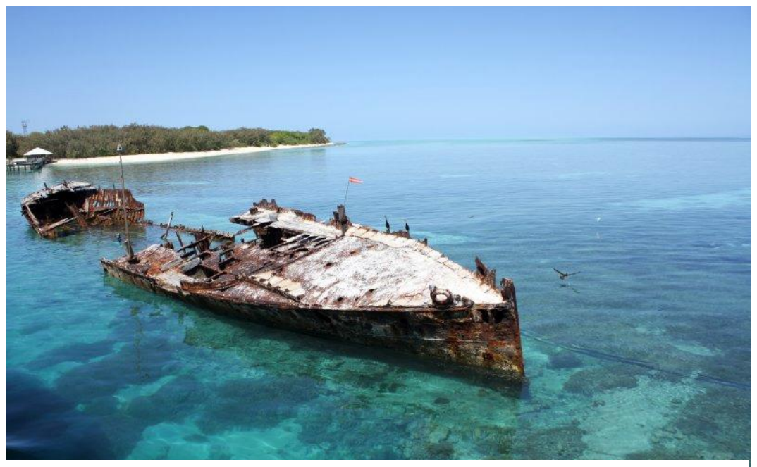
Wreck of HMCS Protector

Other pieces of the Protector are preserved elsewhere. Her stern 6-inch breech-loading gun is outside TS Adelaide at the Birkenhead Naval Deport in Birkenhead, South Australia. A 4-inch quick firing gun is on display outside the Elizabeth and Salisbury Navy Club in Elizabeth, South Australia. The ship's wheel is on display at the RAN Heritage Centre in Garden Island, Sydney.