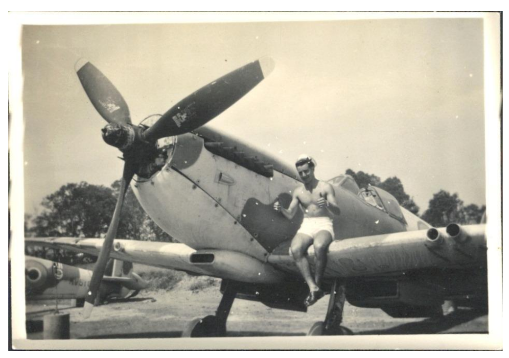
Spitfire VIII A58-691

This enabled the flight deck crews to learn their trade ashore with real aircraft before being sent to sea. Aviation mechanics would run the engines for practice and also taxi the aircraft around the dummy deck. This gave the aircraft handlers and others a chance to experience the problems and dangers of working close to aircraft with noisy engines and spinning propellers. None of the Spitfires were air-worthy and were only maintained to ground run status.