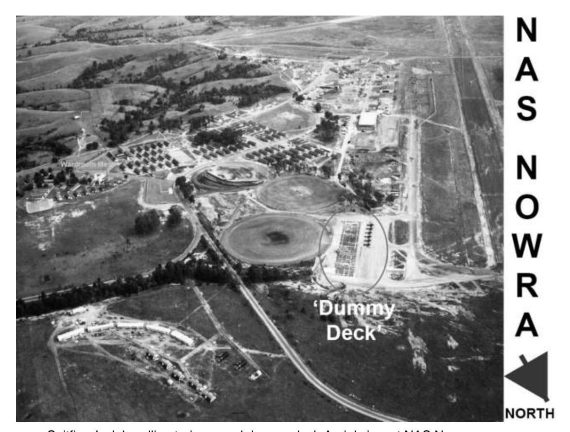
Spitfire deck handling trainers and dummy deck Aerial view at NAS Nowra