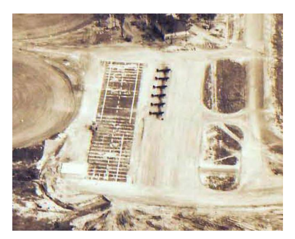
Spitfire deck handling trainers: Aerial view of dummy deck at NAS Nowra