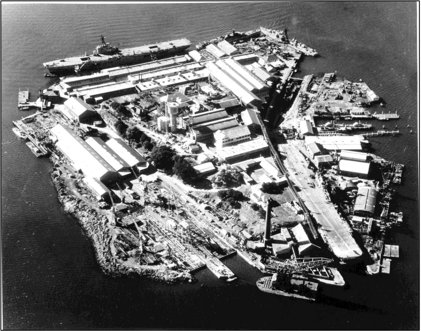
Cockatoo Island 1972