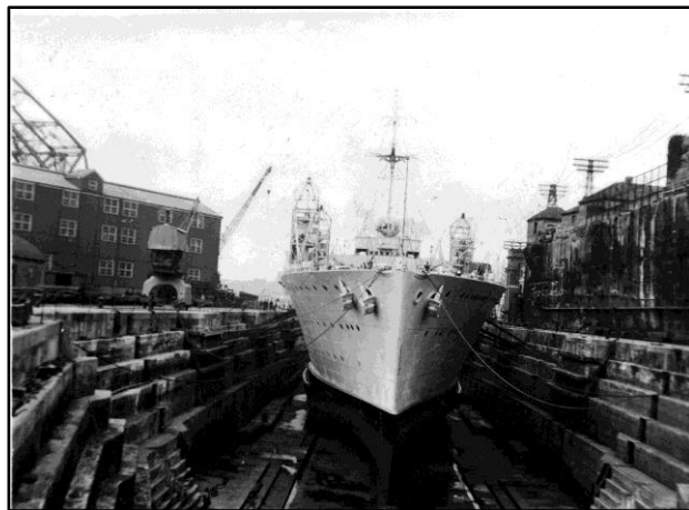
ALBATROSS in Cockatoo Dock Nov 11 1932