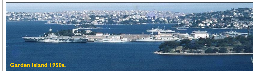
Garden Island 1950s.