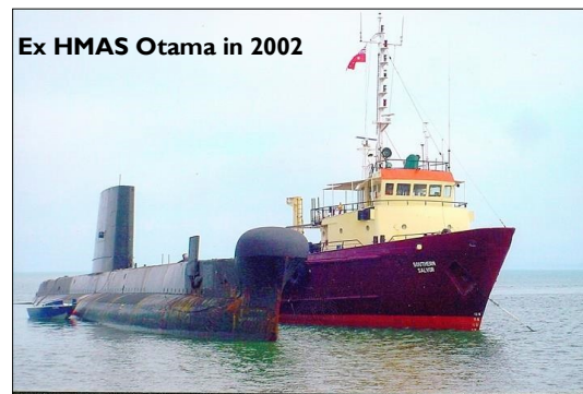
Ex HMAS Otama in 2002

The former Oberon class submarine HMAS Otama, which has been anchored in Western Port for 14 years has finally been earmarked for preservation ashore. The mid October announcement will see the 40-year old boat preserved ashore as a museum vessel at Hastings in Victoria. Otama was paid off on 15 December 2000 and in 2001 was sold to the Western Port Oberon Association, a local community group intending to preserve her as a museum vessel and build the Victorian Maritime Centre in Hastings. Otama arrived in Western Port Bay in 2002, where she was moored while waiting for the approval and development of the museum. Now, 16 years later, some positive news.